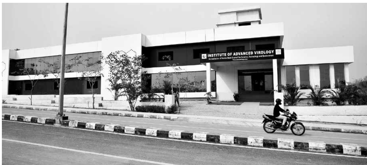
The state-of-the-art- Virology Institute constructed at Thonakkal in Thiruvanthapuram.

thetia, E.N.T, General medicine, Gynaecology, Laboratory, Operation theatre, Orthopaedics, paediatrics and Radiology departments, are to be purchased and steps to install generator and air-conditions are in process.