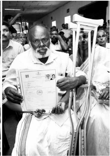
Distribution of land title deeds