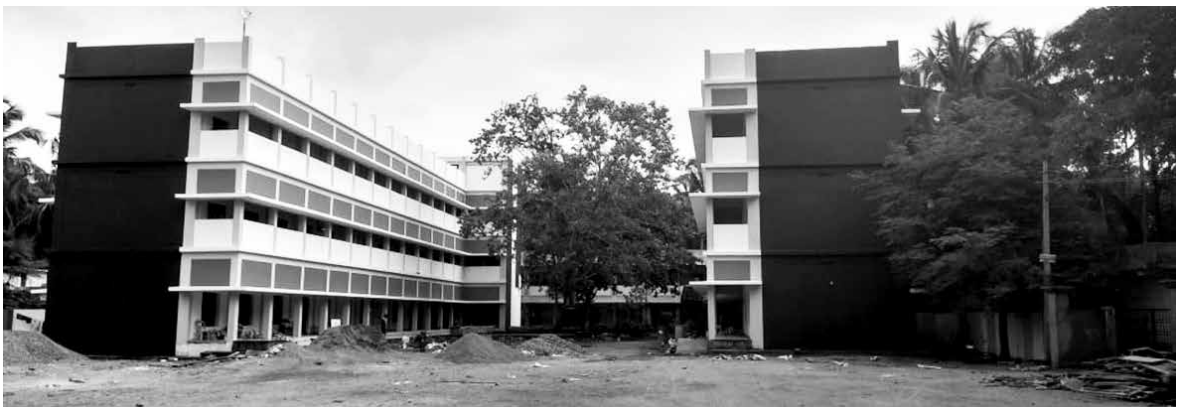
The new building at Purathur GHSS

316 a. Academic monitoring system will be strengthened. There will be permanent monitoring committees which will have clear working plan. This committee will include senior faculty and experts on the level of AEO, DEO etc.