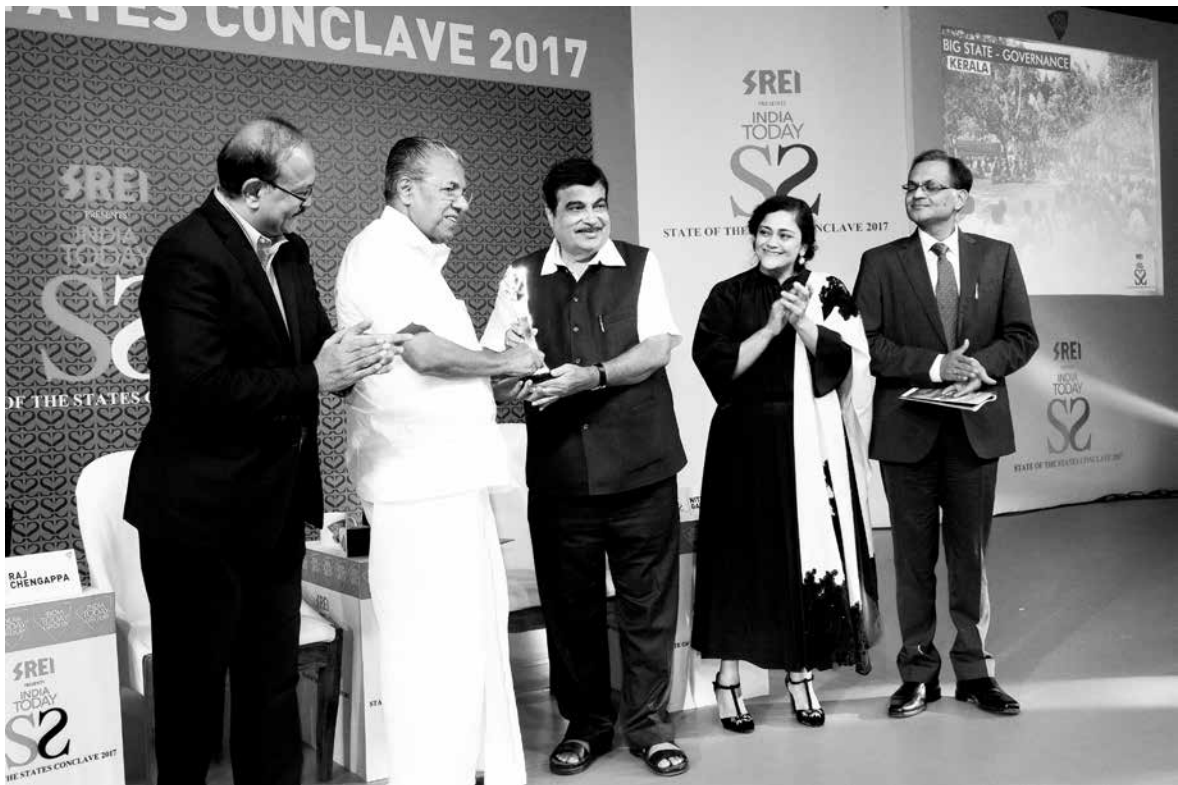
Chief Minister Pinarayi Vijayan receives India Today award for 'excellence in governance' from Union minister Nithin Gadkari.