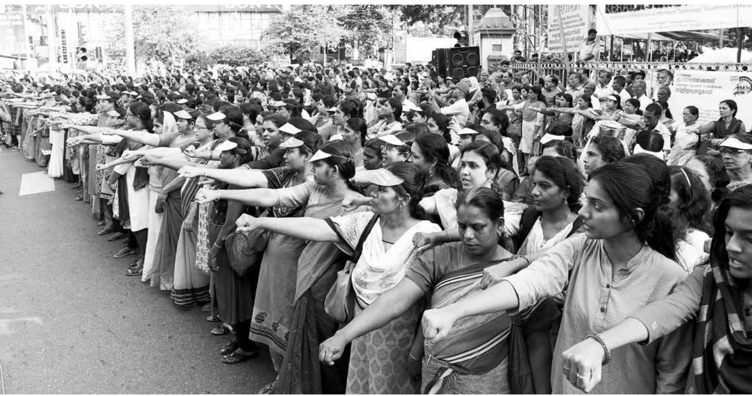
Women's wall constructed by Kerala women for upholding the Renaissance values

For those children who were sexually exploited and aged below 18 years, 13 rehabilitation