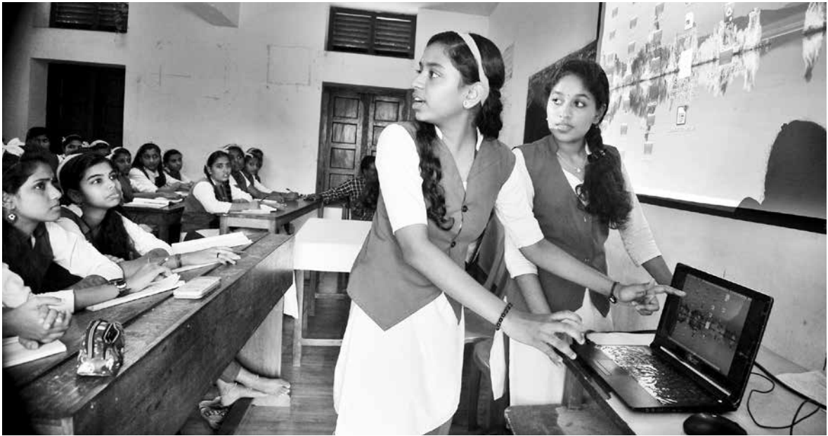
The changing phase of government schools