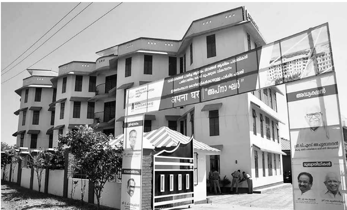
The housing complex 'Apna Ghar' constructed for the migrant labourers at Kanjikode in Palakkad

377 a. For the migrant labourers, the State Government's Welfare Programme introduced in 2010 will be completely modified and made more attractive.