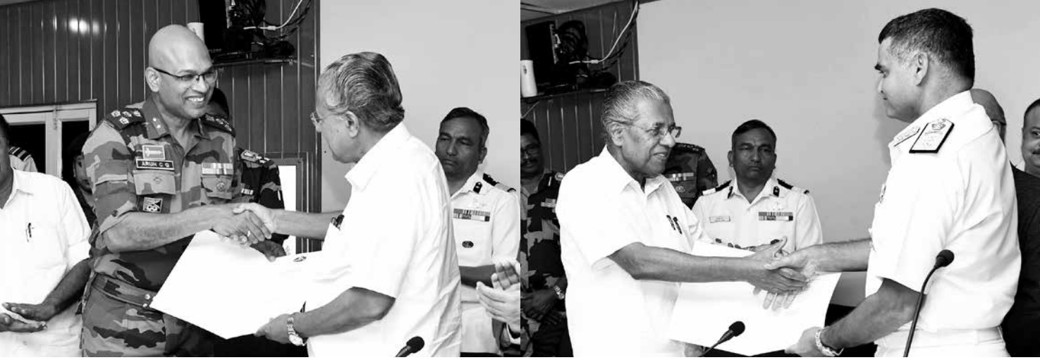
Kerala Government honours the chiefs of Central Forces that engaged in the rescue operations.

roads. Damaged roads were repaired with war footing and the roads that were damaged in landslides and in 2395 places were also made transportation friendly.