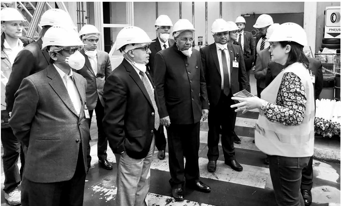
The team led by Chief Minister visits waste treatment plant in Geneva

261 Laws will be executed for taking severe measures against people who pollute air and water.