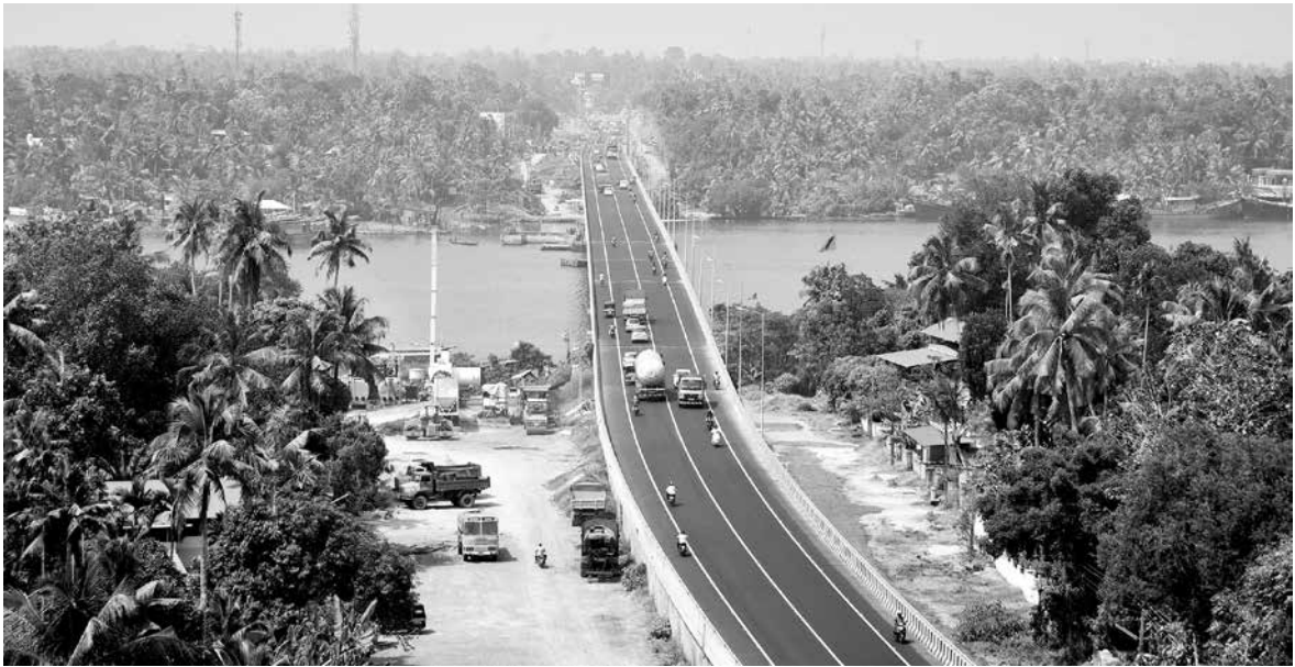
Kollam bypass which was completed by the LDF government.

to call bids for the project in 3 reaches. It is expected to finish the work in this financial year.