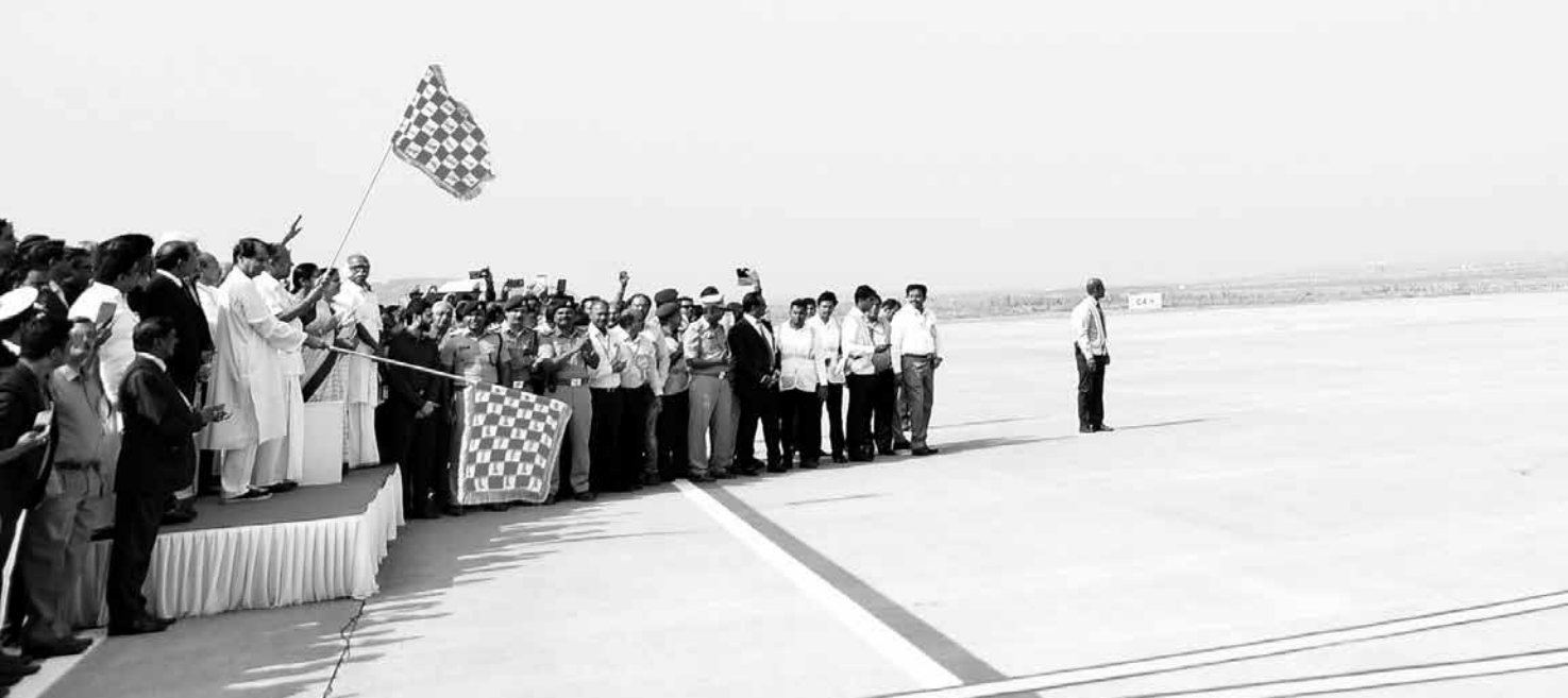
Inaugural ceremony of Kannur International Airport

The work to extend metro rail from Maharaja's to Petta is in the last phase in Kochi. Further extension of metro rail is in the preliminary stage. A decision had been taken to build a Kakkanad township as part of the metro project. The government has put forward a water metro project at a cost of Rs 744 crore whereby solar boats will be used for transportation across lakes. The construction of flyovers at Vyttila and