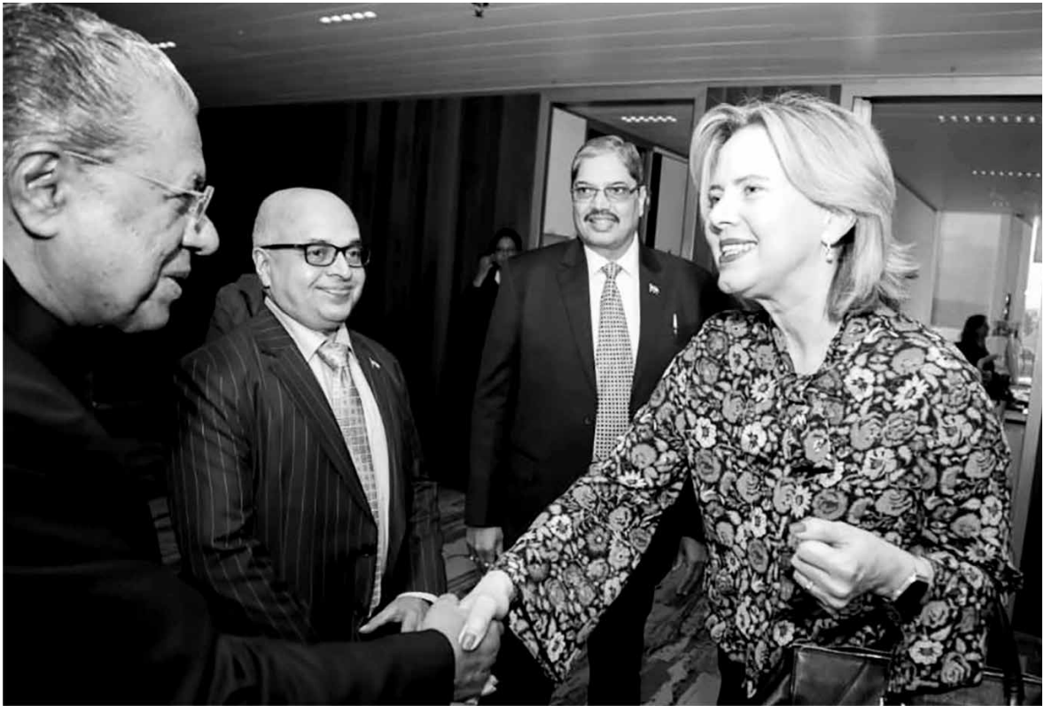
Chief Minister Pinarayi Vijayan is received by Netherlands' minister of Infrastructure and Water Management Cora Van Nieuwenhuizen.

ingredients of this initiative. Kerala which has a long history of implementing social security measures and several progressive interventions like land reforms, state action in education and health, expects to fulfil the present task also through peoples' participation. For this, the strong institutional framework of decentralisation of governance will be of great support.