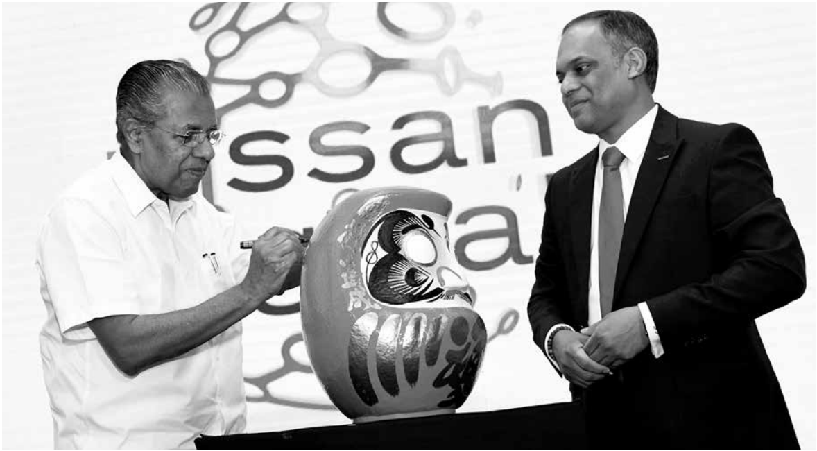
Chief Minister Pinarayi Vijayan during the event regarding the investment of Nissan in Kerala.

in suitable industrial sectors. The operations of the industries which are already operating as clusters, including rubber, plywood, paddy husking, local food, gold ornaments, diamond polishing, plastic materials, tiles, clothes, leather, bamboo, silk, food processing, paint and general engineering, will be studied and lessons will be learned.