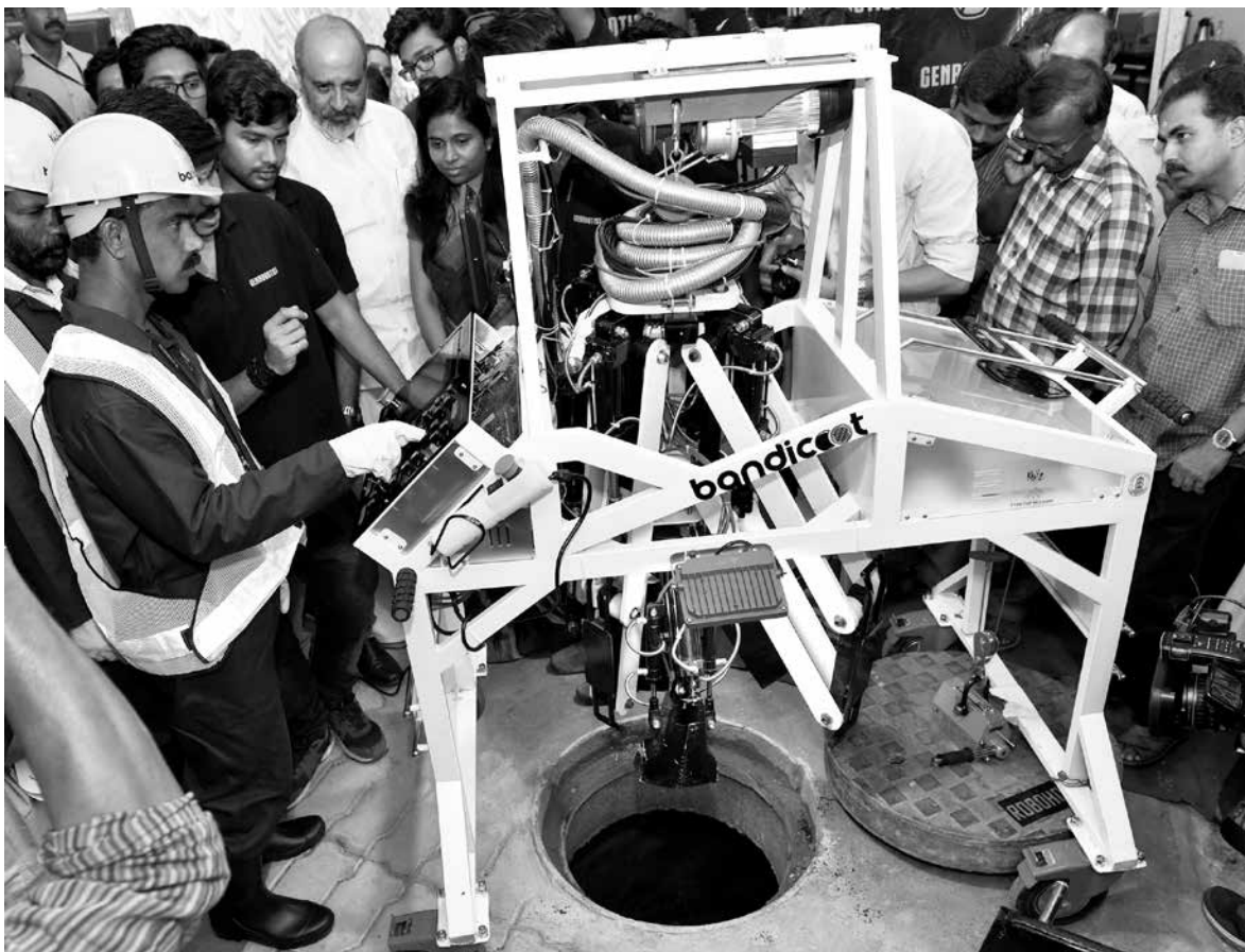
‘BANDICOOT’-the robot used to clean manholes. This was developed by young engineers as per start-up project

to this, the first phase of renovation in 211 schemes was implemented to provide potable water supply to approximately 14000 families residing 64 grampanchayaths of Thrissur, Palakkad, Malappuram, and Kozhikode districts. Technical permit has been provided and initial activities started for 172 renovation and restoration schemes that were done in collaboration with the beneficiary committee and gram panchayath, and with their financial shares. All the works are expected to be completed by May 31, 2019.