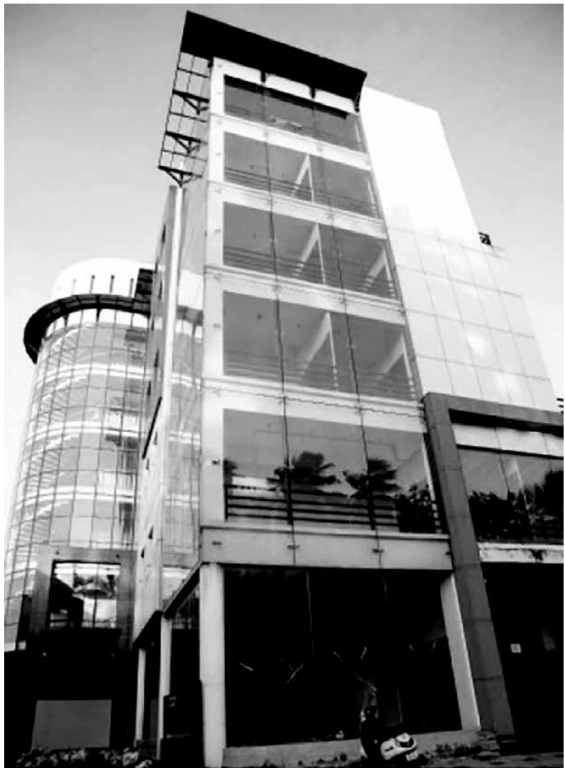
The Women's Mall, started by Kudumbashree at Kozhikode

c) The Mission will be re-organised in a transparent way, based on guide-