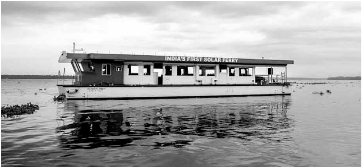
India's first solar boat service

cess of the Sabarimala Safe Zone project. 51 new enforcement squads were set up in the Motor Vehicles Department taking the total number to 85 for which 187 additional posts of assistant motor vehicle inspectors (AMVI), 65 motor vehicle inspectors and 10 RTOs were created. The required number of candidates who cleared the PSC exam got into the job as AMVIs after undergoing training. Steps were taken to make available the required number of vehicles for the project on wet lease with the financial backing of Kerala Road Safety Authority. The final phase of work is progressing to set up control rooms.