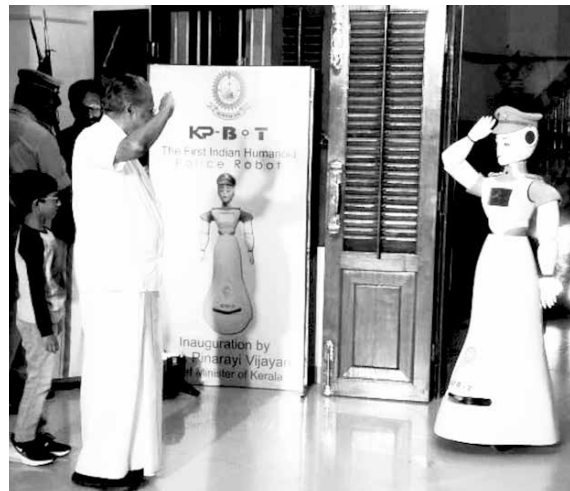
The Robot at the police headquarters salutes the Chief Minister

Steps have begun to make Law and Order, Crime Investigation as two separate wings. In Police Stations, CIs were appointed as Station House Officer. The government is considering a direction to appoint higher police officials in